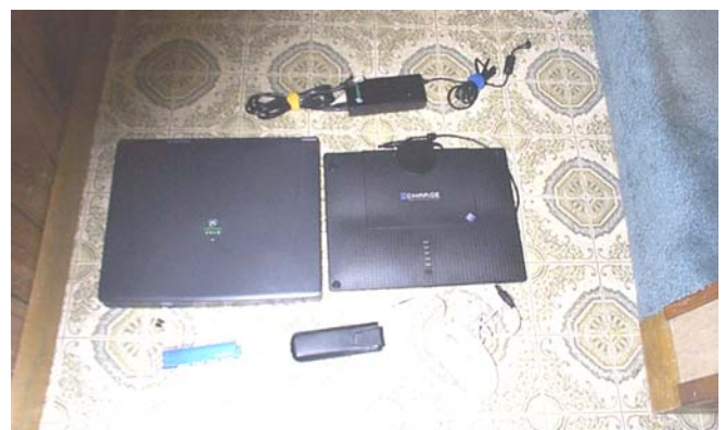
Inside the Laptop Case