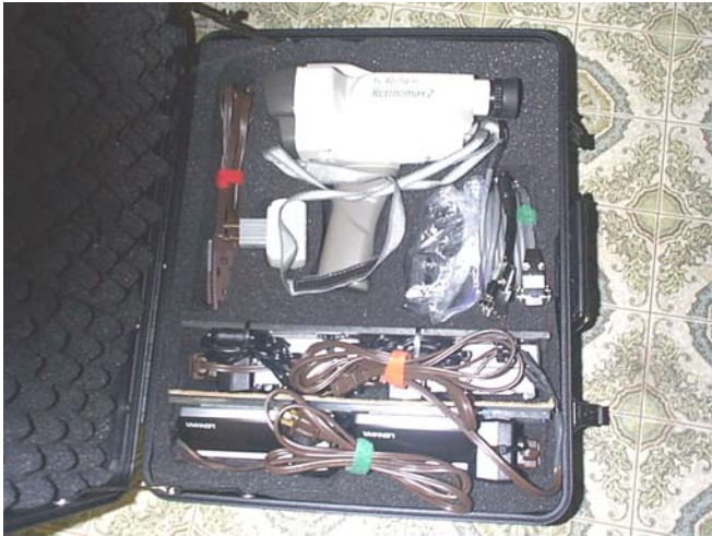
Inside autorefractor case, batteries at the bottom

The following page shows the cost for the equipment involved. Below are several pictures showing the components that have been purchased. These pictures also show the extreme care taken in designing equipment packaging.