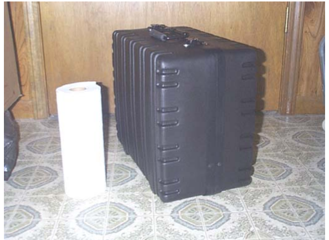
Autorefractor case from the outside.